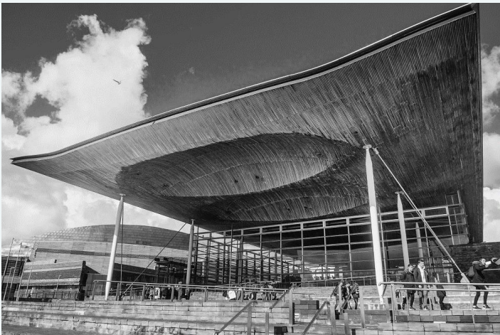
Welsh Parliament/ Senedd Cymru