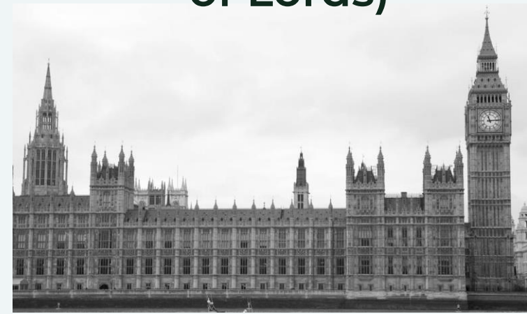
UK Parliament (House of Commons & House of Lords)