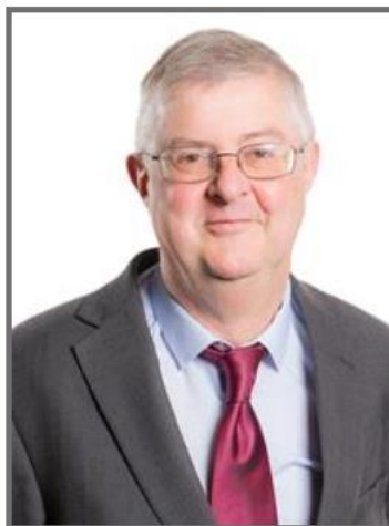
Mark Drakeford MS